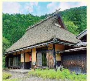
Matabe thatched B&B

There are more than 30 accommodations in Miyama, including inns, guesthouses, and private lodgings. Among them, the thatched roof inns are especially recommended. Enjoy your stay while feeling the atmosphere of Japan.