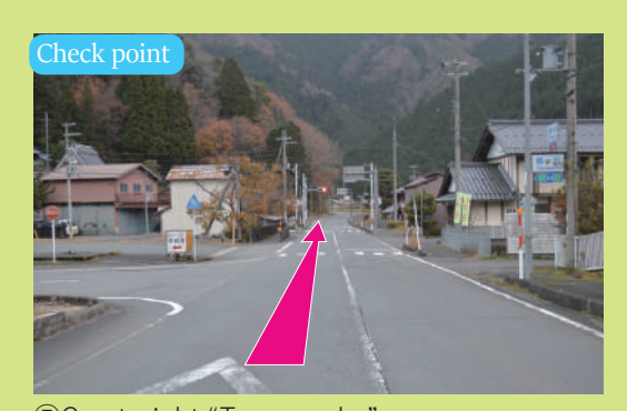
\ensuremath{{\mathbb{T}}} Go straight "Tsurugaoka".