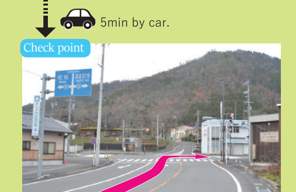
⑤Turn right at "Izumi" for Route162.