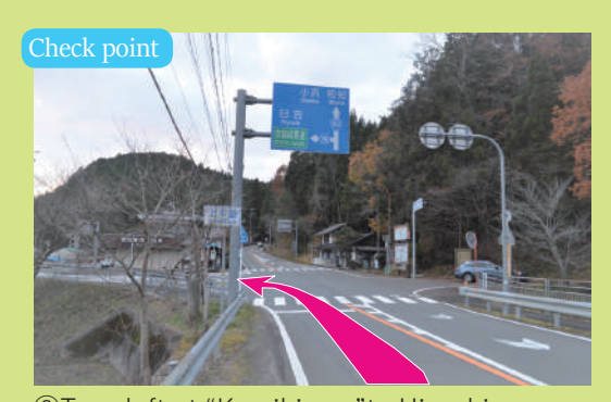
③Turn left at "Kamihiraya" to Hiyoshi.