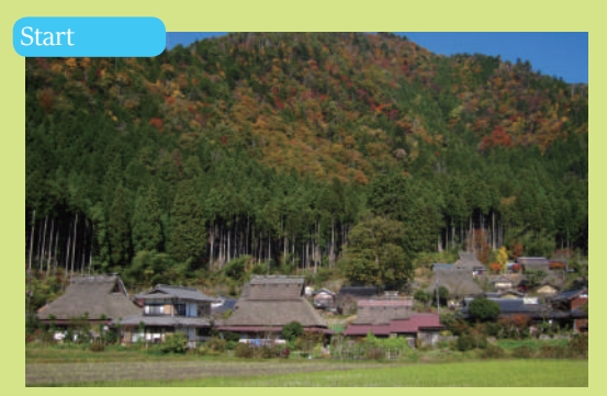
①Take Route38, Drive west from thatched village.