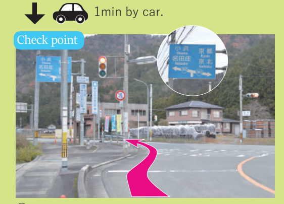
⑥Turn left at Shizuhara to Obama/natasho direction.