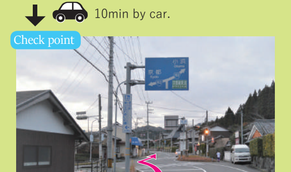
②Turn right at at "Agake" Drive to Obama.